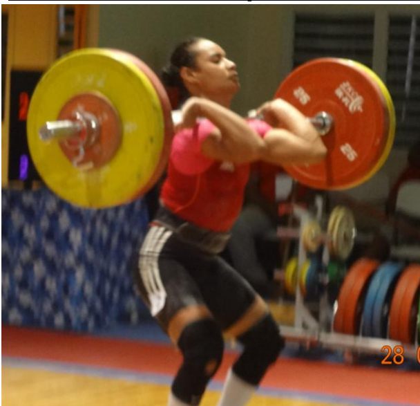
Dika Toua (Papua New Guinea)