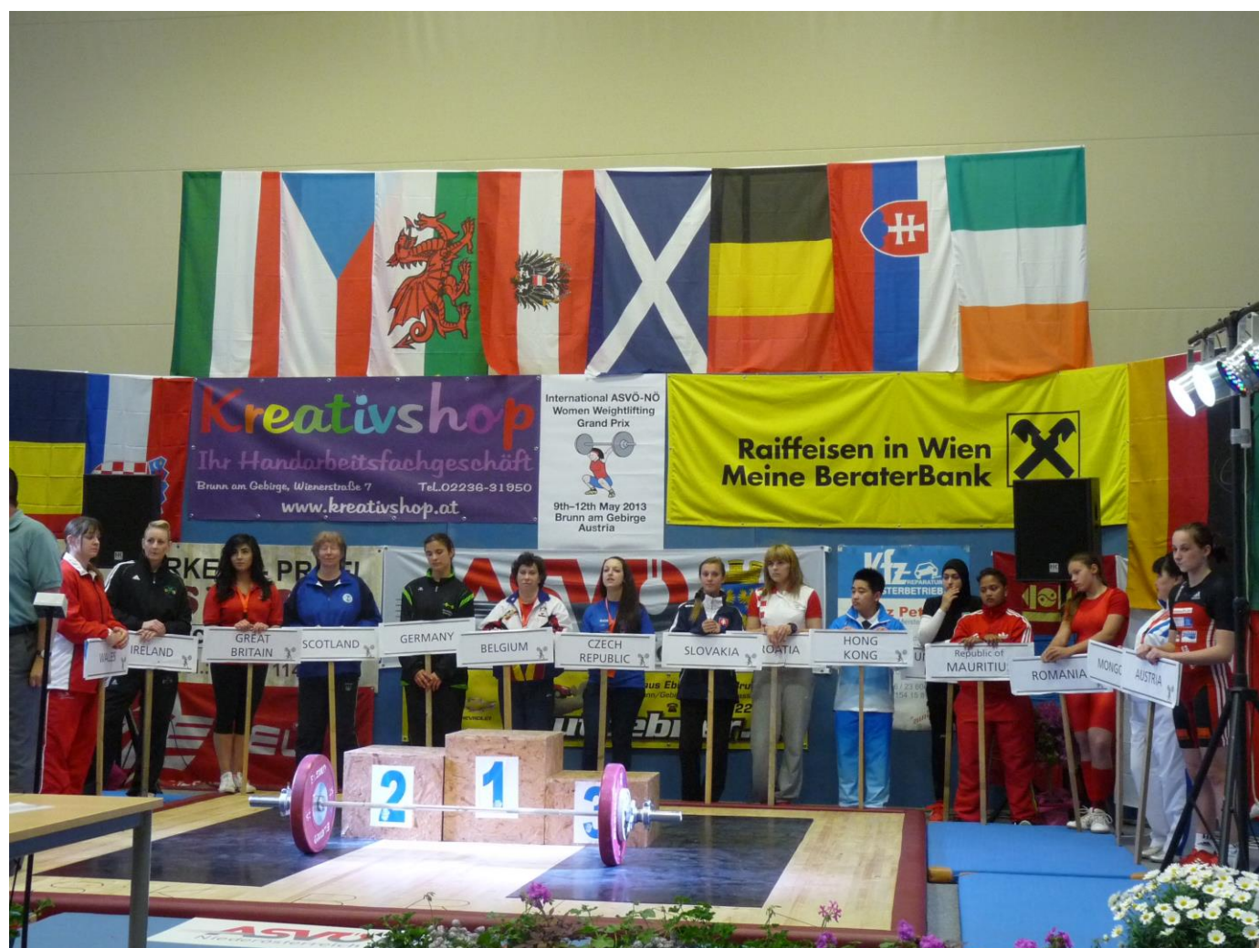
Women Grand Prix 2013 in Brunn am Gebirge – Austria

Sunday 17 th May 2015 Departure of Delegations